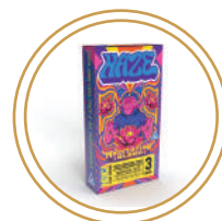
Haze Edibles and Vapes