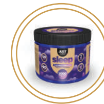
JustCBD Sleep Gummies