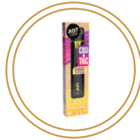
CBD + THC All in One