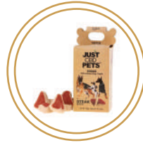
JustCBD Pet Treats